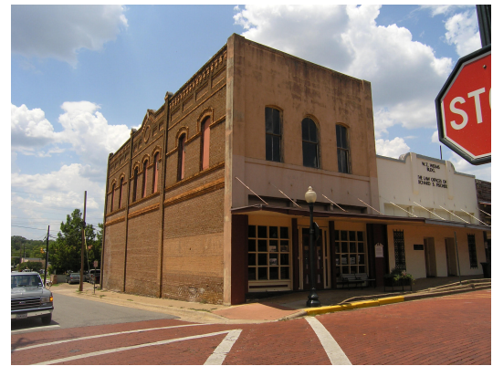
City of Nac Reference Image

City of Nac Commercial List One-Part Commercial Block Two-Part Commercial Block Enframed Window Wall Stacked Vertical Block Two-Part Vertical Block Three-Part Vertical Block Temple Front Enframed Block Central Block with Wings Arcaded Block Mixed